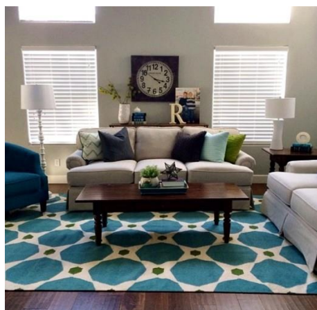
An Uncluttered, Organized Environment