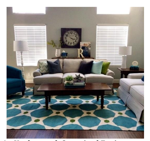
An Uncluttered, Organized Environment

Phone: 800-GOT-PESTS (468-7378) www.franklinpestsolutions.com